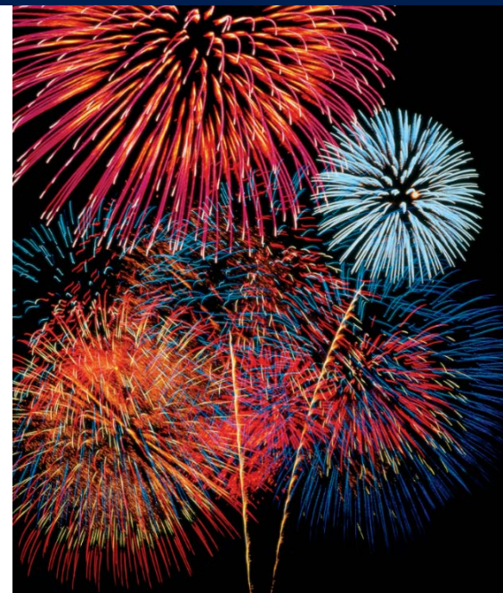
Huge firework to celebrate the New Year