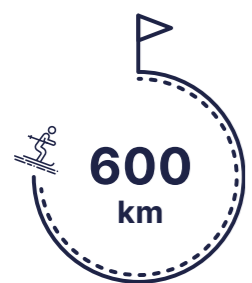
Alpine ski slopes