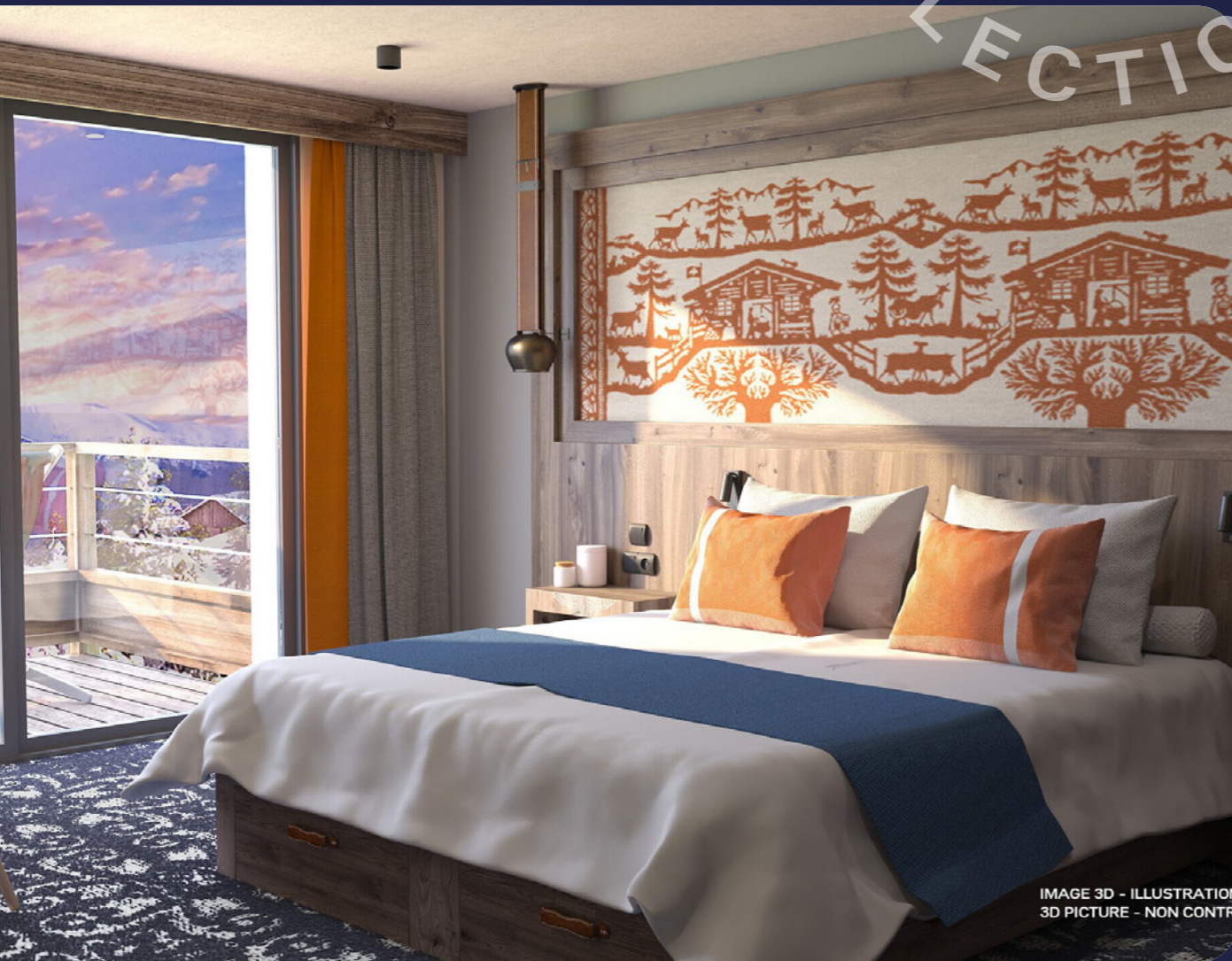
IMAGE 3D - ILLUSTRATION 3D PICTURE - NON CONTR